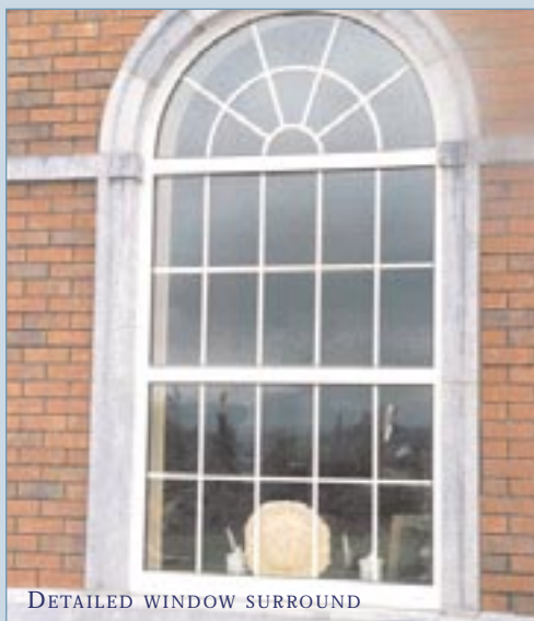
DETAILED WINDOW SURROUND