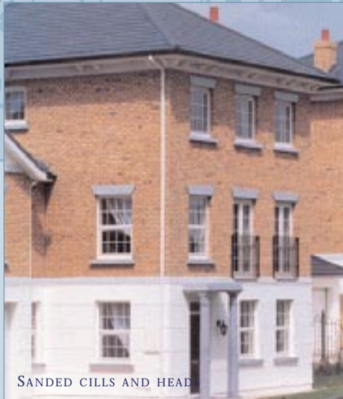
SANDED CILLS AND HEADS

Cills can be the traditional flat cill, which can be 'kicked up' a few degrees during installation to give a water run off. Also can be sloped or splayed in manufacture.