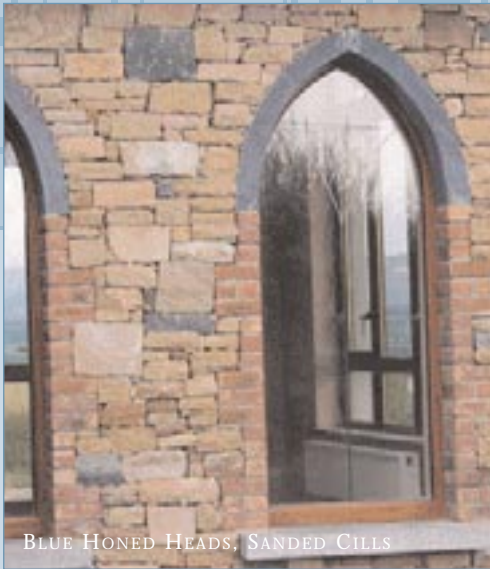
BLUE HONED HEADS, SANDED CILLS