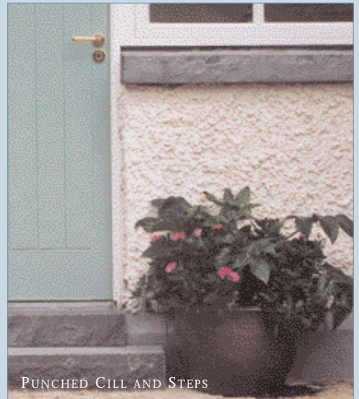
PUNCHED CILL AND STEPS