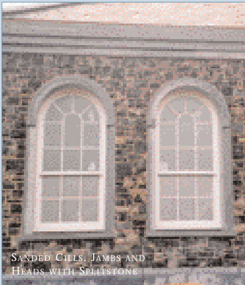
SANDED CILLS, JAMBS AND HEADS WITH SPLITSTONE

Limestone cills work very well with brick, render and natural stone facades.