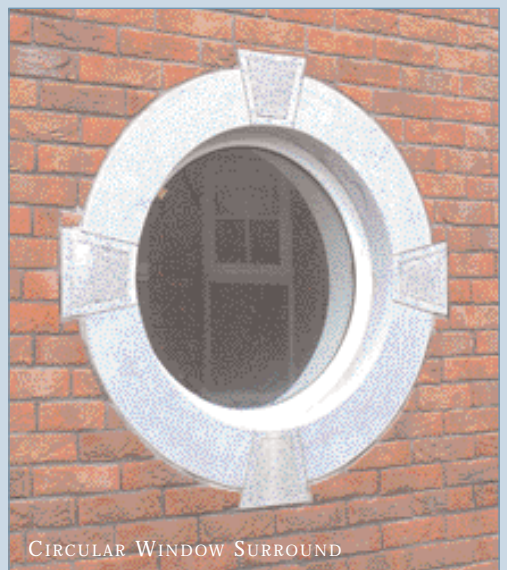
CIRCULAR WINDOW SURROUND