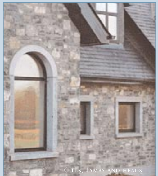
CILLS, JAMBS AND HEADS