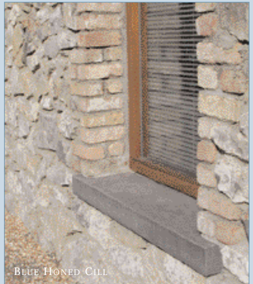
BLUE HONED CILL