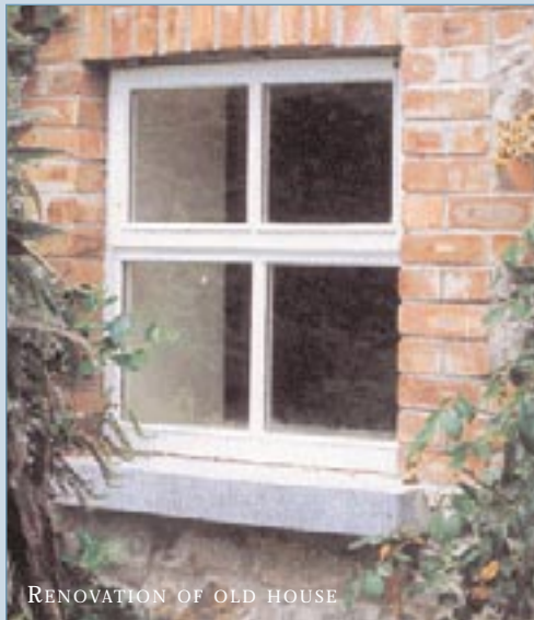
RENOVATION OF OLD HOUSE